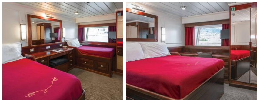
Insets clockwise from top: Lord of the Glens; Category 2 cabin with twin beds; Category 2 cabin with a double bed.